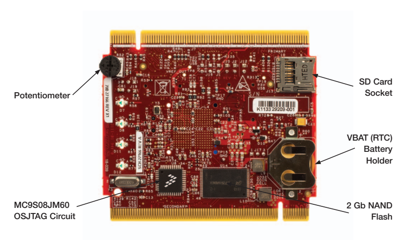
Figure 2: Back side of TWR-K70F120M module.